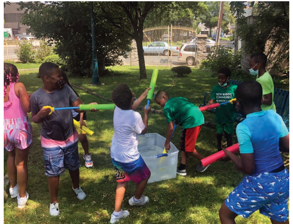
NCC Campers enjoy water activities on a hot summer day.