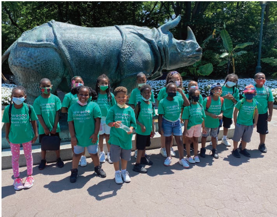
NCC Campers on a field trip to the Bronx Zoo pose for a group photo in front of rhino statue.