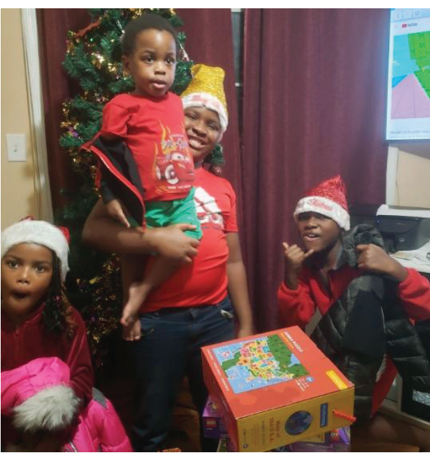
A family enjoys their presents from the New Community Toy Drive.