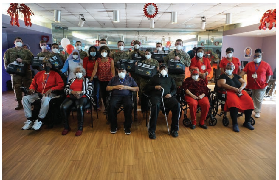
New Community Extended Care Facility residents and staff members present members of the New Jersey National Guard with gift bags to show their appreciation for the support provided to the facility from Jan. 27 to Feb. 11.

Members of the New Jersey National Guard were assigned to New Community Extended Care Facility from Jan. 27 to Feb. 11 to assist with resident care. The deployment was part of a statewide effort to assist long-term care facilities with their COVID-19 response and to help with staffing shortages brought on by the surge of cases due to the Omicron variant of the virus.