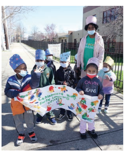
Community Hills Early Learning Center ended the Week of the Young Child with a parade around the building.