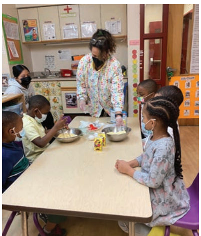
Students learned what goes into cooking on Tasty Tuesday as part of the Week of the Young Child.