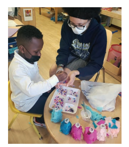
Children made instruments on Music Monday as part of the Week of the Young Child.

Students and staff members at Community Hills Early Learning Center (CHELC), 85 Irvine Turner Boulevard, Newark, celebrated the Week of the Young Child from April 4 to 8. Themes included Music Monday, Tasty Tuesday and Work Together Wednesday. Students and staff members finished the week with a parade around the center and fun activities in the parking lot. The Week of the Young Child, established in 1971, is an annual celebration sponsored by the National Association for the Education of Young Children. The purpose is to focus public attention on the needs of young children and their families and to recognize the early childhood programs and services that meet those needs. Visit newcommunity.org to see additional photos.