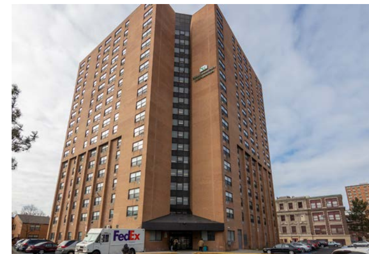
Commons Senior, located at 140 South Orange Ave., Newark, is one of New Community's eight buildings for senior and disabled residents.

The majority of NCC housing is located in the Central Ward of Newark with additional properties located in Newark's West Ward, Jersey City and Orange, N.J. Properties are surrounded by various eateries, supermarkets, hospitals, daycare centers, state and local social service agencies and entertainment venues. The close proximity of properties to these retail establishments and services makes it very convenient and accessible for residents.