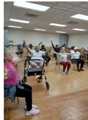
Orange Senior hosted Zumba for residents on Nov. 11.