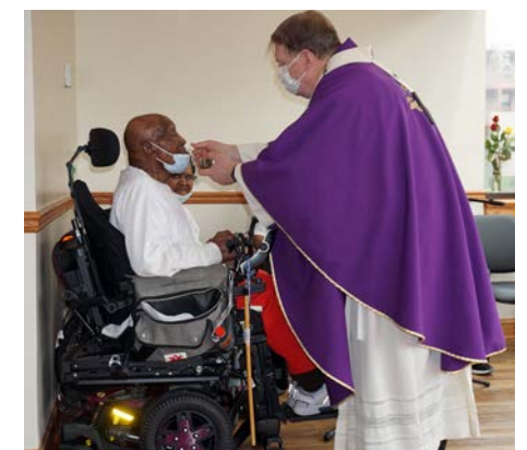
Cardinal Tobin offers communion to an Extended Care resident during the facility's chapel blessing on March 27.