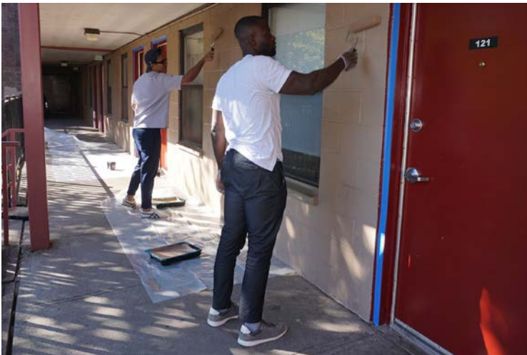
Volunteers from McKinsey & Company paint the exterior of Harmony House on Oct. 18.