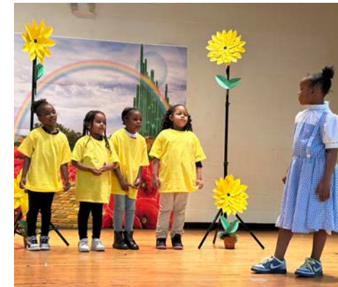
Students in the after school program performed The Wiz on May 22.