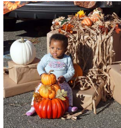
Community Hills Early Learning Center (CHELC) hosted a fall themed trunk-or-treat on Oct. 31.