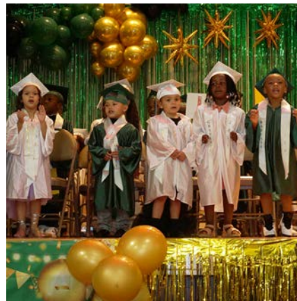
Students of Community Hills Early Learning Center (CHELC) performed during graduation on June 21.