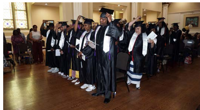
NCCTI hosted graduation on June 14.

RWJBarnabas Health, Turner Construction and Rutgers University. Key events included a Guidance Counselor Luncheon in March and a Graduation Ceremony in June. Throughout the year, students participated in career development activities, including job interviews at Maplewood Country Club and a Saint Michael's Medical Center tour.