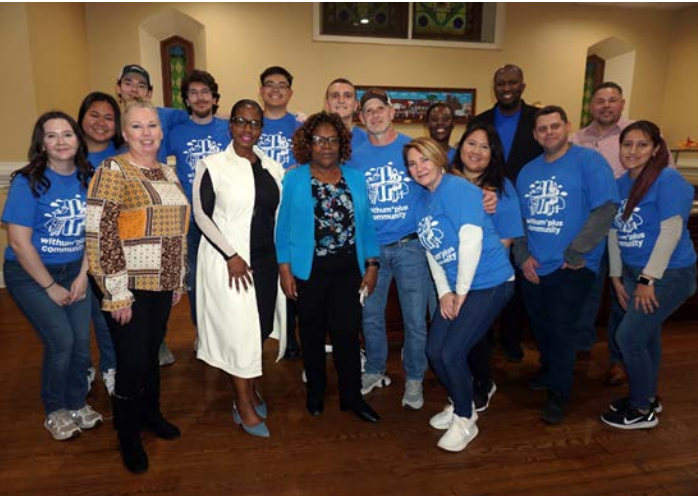
Accounting firm Withum hosted Thanksgiving dinner for Harmony House families on Nov. 26 at Monsignor William J. Linder Plaza.

A grant from the Department of Community Affairs enabled Harmony House to redo the concrete stairs and sidewalks of the shelter as well as paint the railings.