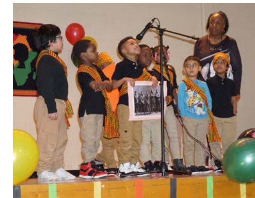
The after school program Black History Month program on March 1.