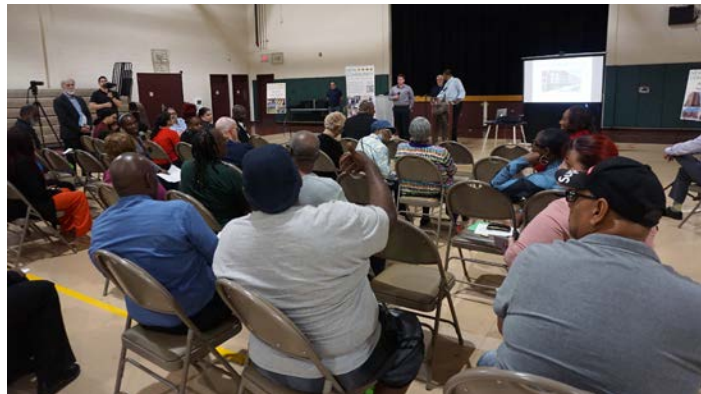
Members of the public gathered at the NCC Neighborhood Center on June 5 for the Community Meeting to learn about The Morris housing redevelopment project.

"Nothing like that has been built in Newark in many, many years," he said. "We're really excited."