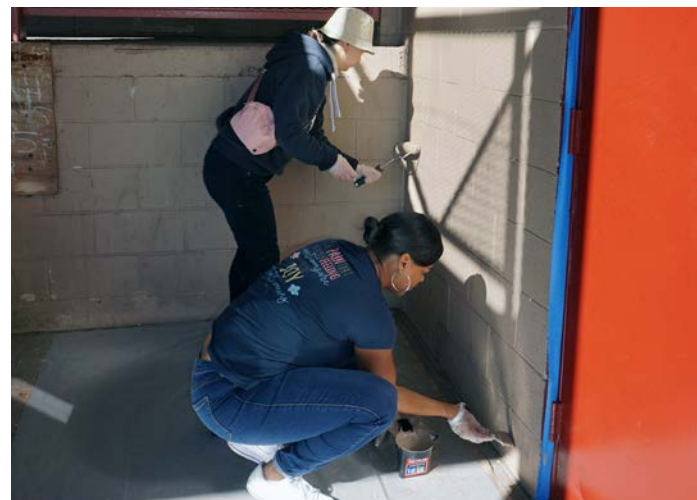
Volunteers from McKinsey & Company paint the exterior of Harmony House.