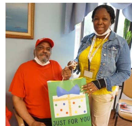
Extended Care hosted Adopt-a-Resident Day on May 15 to show appreciation to its residents.

Spiritual care is extremely important at Extended Care, regardless of an individual's religious beliefs. The facility has a newly renovated chapel, which received an opening blessing from Cardinal Joseph Tobin on March 27 (see page 5 for more information). The chapel is available for use by those of all faiths.