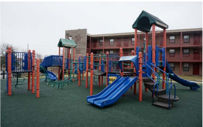
The playground at Harmony House reopened for children's use in 2024 after repairs were made.