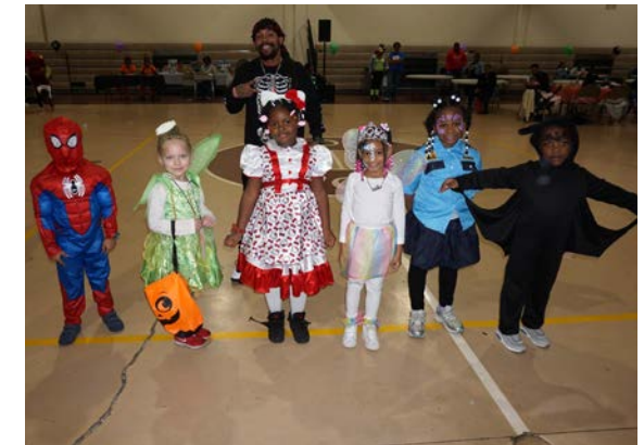
The Youth Services Halloween Party on Oct. 26.