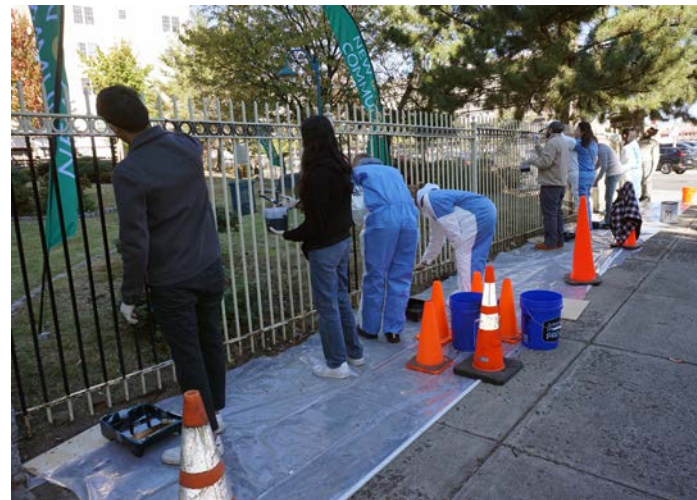
The fencing surrounding Meditation Park got a new coat of paint thanks to volunteers from McKinsey & Company.