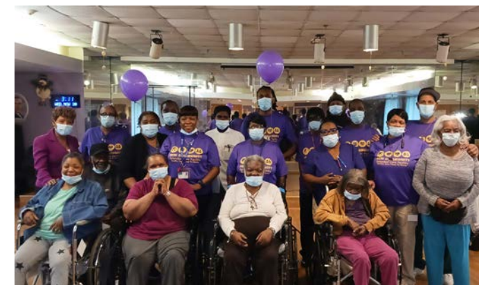
Extended Care residents participated in an Antibiotics Stewardship Awareness event on Nov. 20 where they learned the importance of only taking antibiotics when necessary.