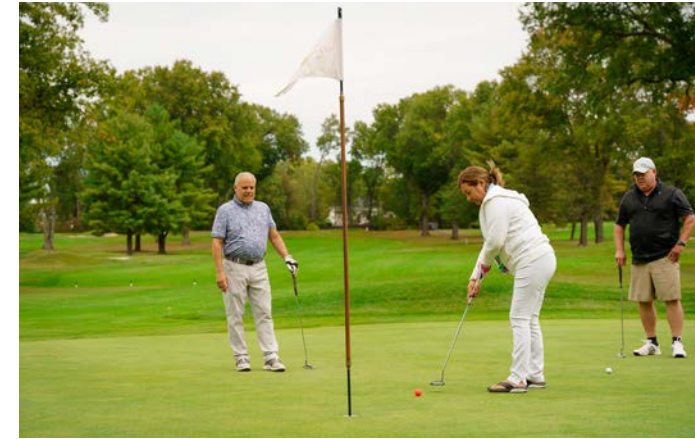
Participants at New Community Golfing for a Cause enjoyed a round of 18 holes of golf at Cedar Hill Golf and Country Club in Livingston on Sept. 23.