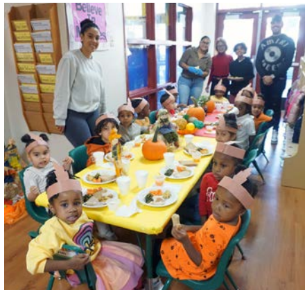
Children and parents celebrated Thanksgiving at Community Hills Early Learning Center (CHELC) on Nov. 27.

HHELC served 32 infants and toddlers in Early Head Start and 15 pre-K students for a total of 47 children for the 2024-2025 school year.