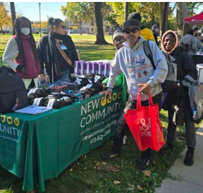
Representatives from Harmony House participated in the Newark Emergency Services for Families (NESF) Fifth Annual World Homeless Day on Oct. 11 in Lincoln Park, Newark.