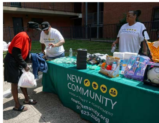
Employees at Manor Family at 225 Hunterdon St., Newark, organized Cleanup Day on July 26 where they also handed out items to residents.