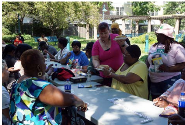
Residents of Associates, Commons Senior, Manor Senior, Orange Senior and Roseville Senior gathered at Meditation Park for lunch on Aug. 27.