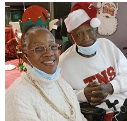
Residents and their family members enjoyed a Christmas party at the facility on Dec. 18.