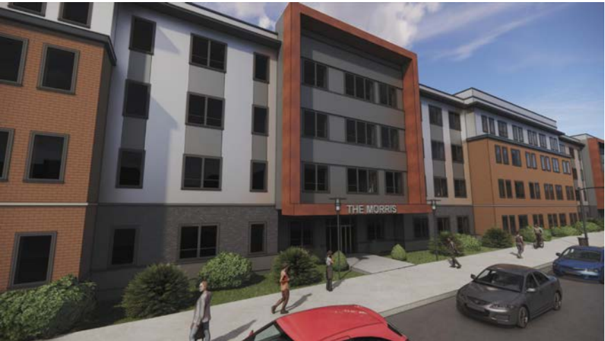
A rendering of The Morris, to be built on Morris Avenue in Newark next to the New Community Property Management office and across the street from Gardens Senior.

In 2024, NCC was active in identifying and beginning to undertake new real estate development projects and continuing efforts on proposed projects. NCC has a number of opportunities to implement, especially in the NCC footprint. The organization has a long and successful history in developments that make a difference in the lives of inner-city residents. These developments focus primarily on quality, affordable housing but have also included a charter school, workforce training center and an extended care facility.