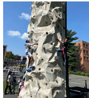
The Back 2 School Jam on Sept. 14.