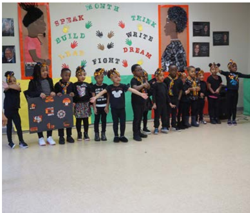
Community Hills Early Learning Center (CHELC) students performed in a Black History Month event on Feb. 23.