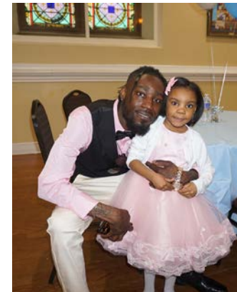
The Father-Daughter Dance on April 20.