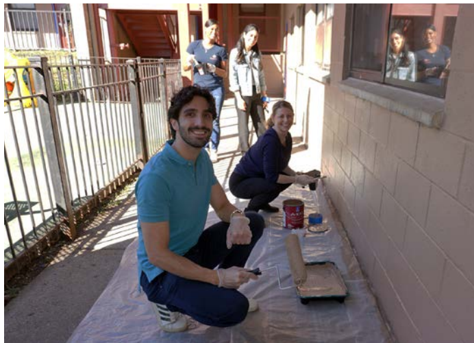
McKinsey & Company volunteers enjoyed their time painting the exterior of Harmony House.

New Community welcomed volunteers from McKinsey & Company on Oct. 18 who worked on projects at Meditation Park and Harmony House, New Community's shelter facility for homeless families. Volunteers beautified the park and painted the exterior of Harmony House making both spaces more inviting for our residents. New Community appreciates the volunteers' efforts and looks forward to inviting them back for future projects.