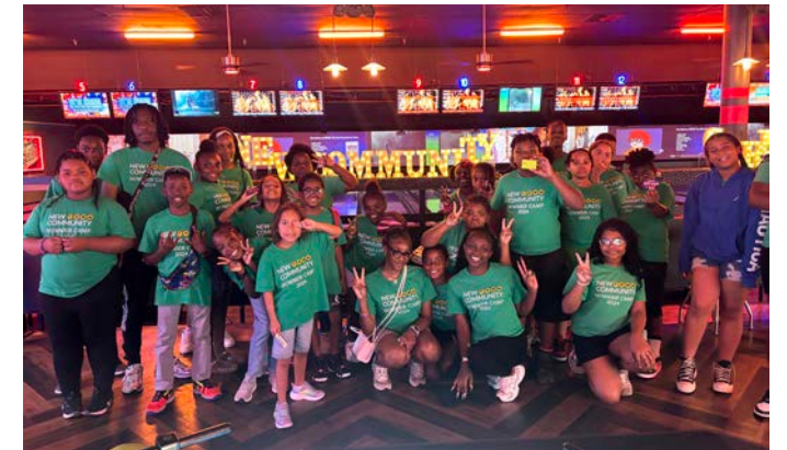
One of the many Summer Camp 2024 trips.