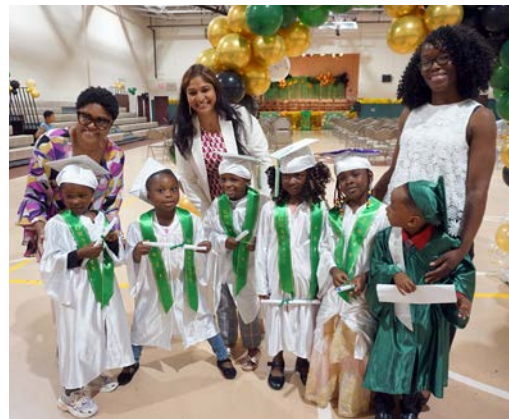
Staff members with graduates of Harmony House Early Learning Center (HHELC) on June 21.