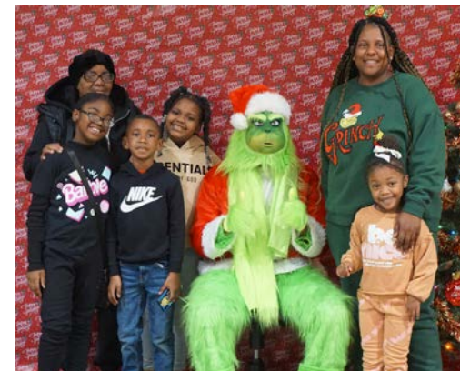
Breakfast with the Grinch on Dec. 14.