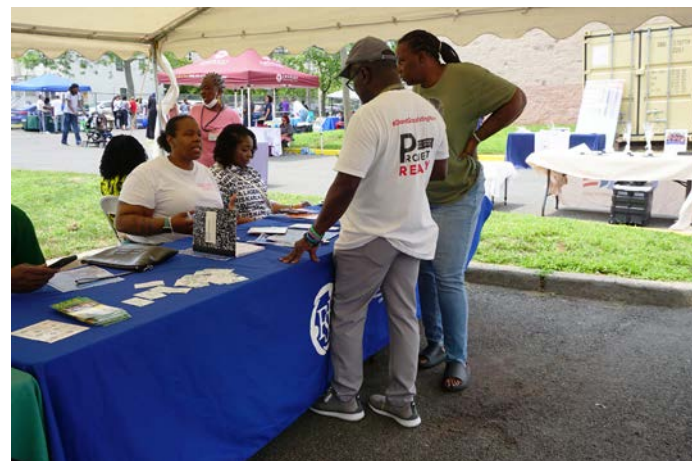
Representatives from Family Service Bureau of Newark (FSB) provide information during the 2024 New Community Health Fair on July 25.

linguistically appropriate services to the Spanish-speaking population. Moreover, the division provides services to youth in collaboration with six Newark Public Schools through its Family Crisis Intervention Unit (FCIU).