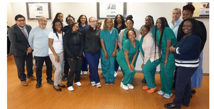
NCCTI celebrated Medical Assistants Recognition Week on Oct. 22 with a pinning ceremony for students in the medical programs.