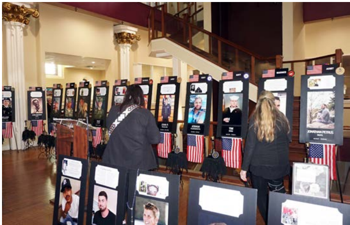
One section of The Black Poster Project display featured members of the U.S. military.