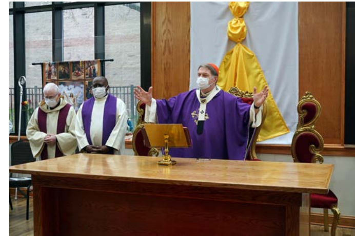
Cardinal Joseph Tobin conducts the inaugural mass at the New Community Extended Care Facility chapel on March 27.

New Community Extended Care Facility welcomed Cardinal Joseph Tobin, the Archbishop of Newark, for mass on March 27 where he blessed the facility's newly finished chapel.