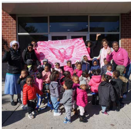
Harmony House Early Learning Center (HHELC) held a Breast Cancer Awareness Walk on Oct. 18.