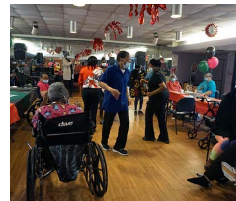
Extended Care residents and staff members celebrated Black History Month on Feb. 23.