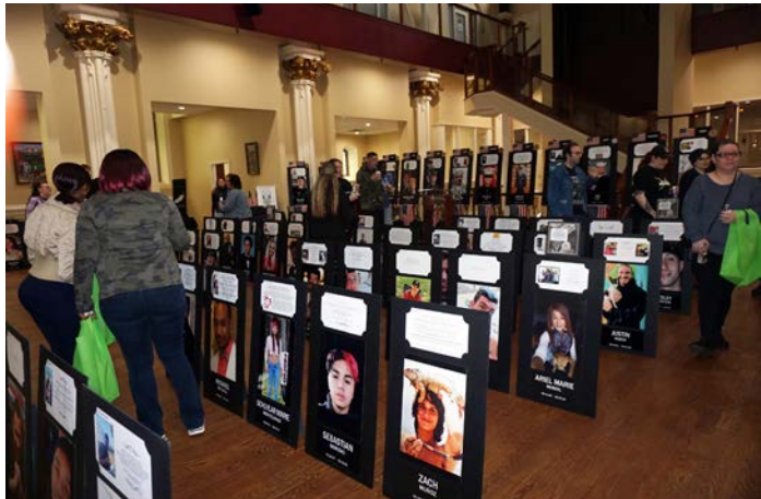
Attendees of A Gathering of Hope & Healing look through the display of posters showcasing those lost to addiction.

New Community’s Family Service Bureau of Newark (FSB) hosted A Gathering of Hope & Healing on April 27 to raise awareness about addiction and mental health. The event, held at Monsignor William J. Linder Plaza, featured a display from The Black Poster Project, an addiction and overdose awareness group from New Jersey that travels with posters showcasing those lost to addiction.