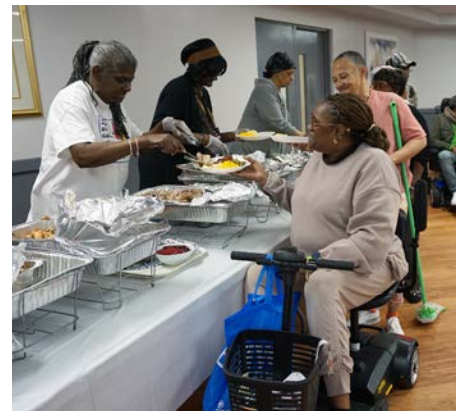
Commons Senior held a Mother's Day celebration for its residents on May 10.