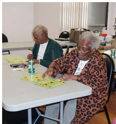
Gardens Senior hosted a health event on Oct. 3 that included bingo.