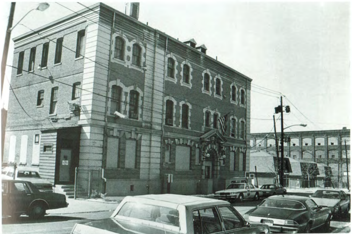
The Fourth Police Precinct, near what is now Irvine Turner Boulevard, was the center of the summer disturbances in July 1967.