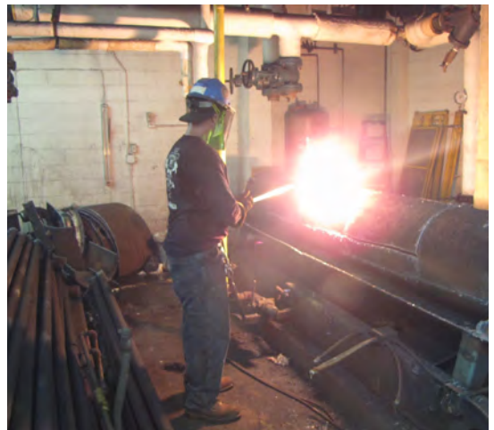
Bottom right: Contractors remove the old boiler and install a new state-of-the-art boiler system with substantially increased efficiency.