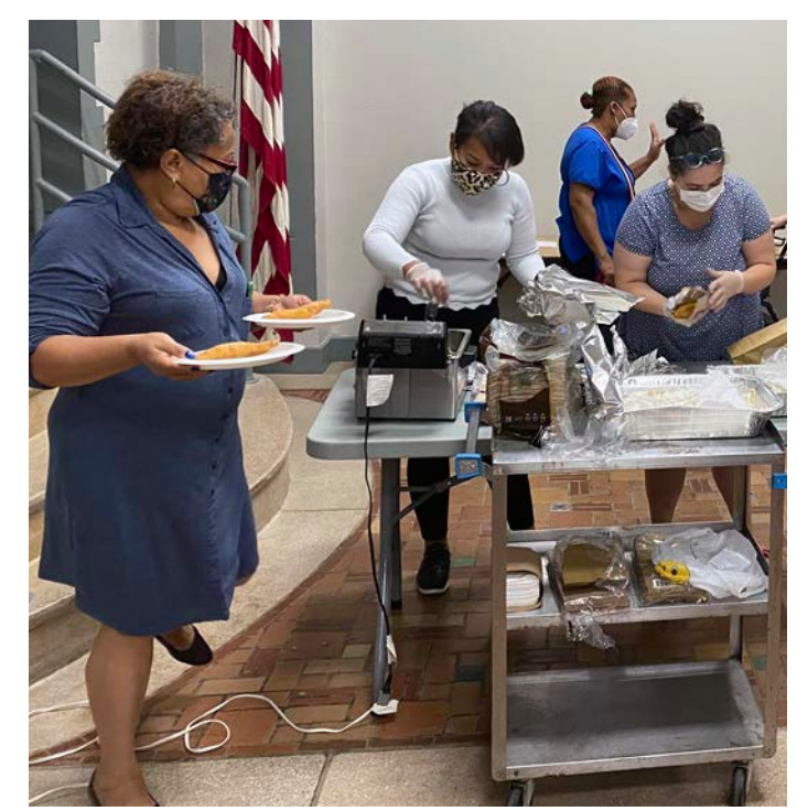
ew Community Douglas Homes hosted a fundraiser on Sept. 17. Douglas Homes staff cooked and sold empanadas to raise money for events and game nights. The event had a great turnout. All those who attended enjoyed empanadas and games.